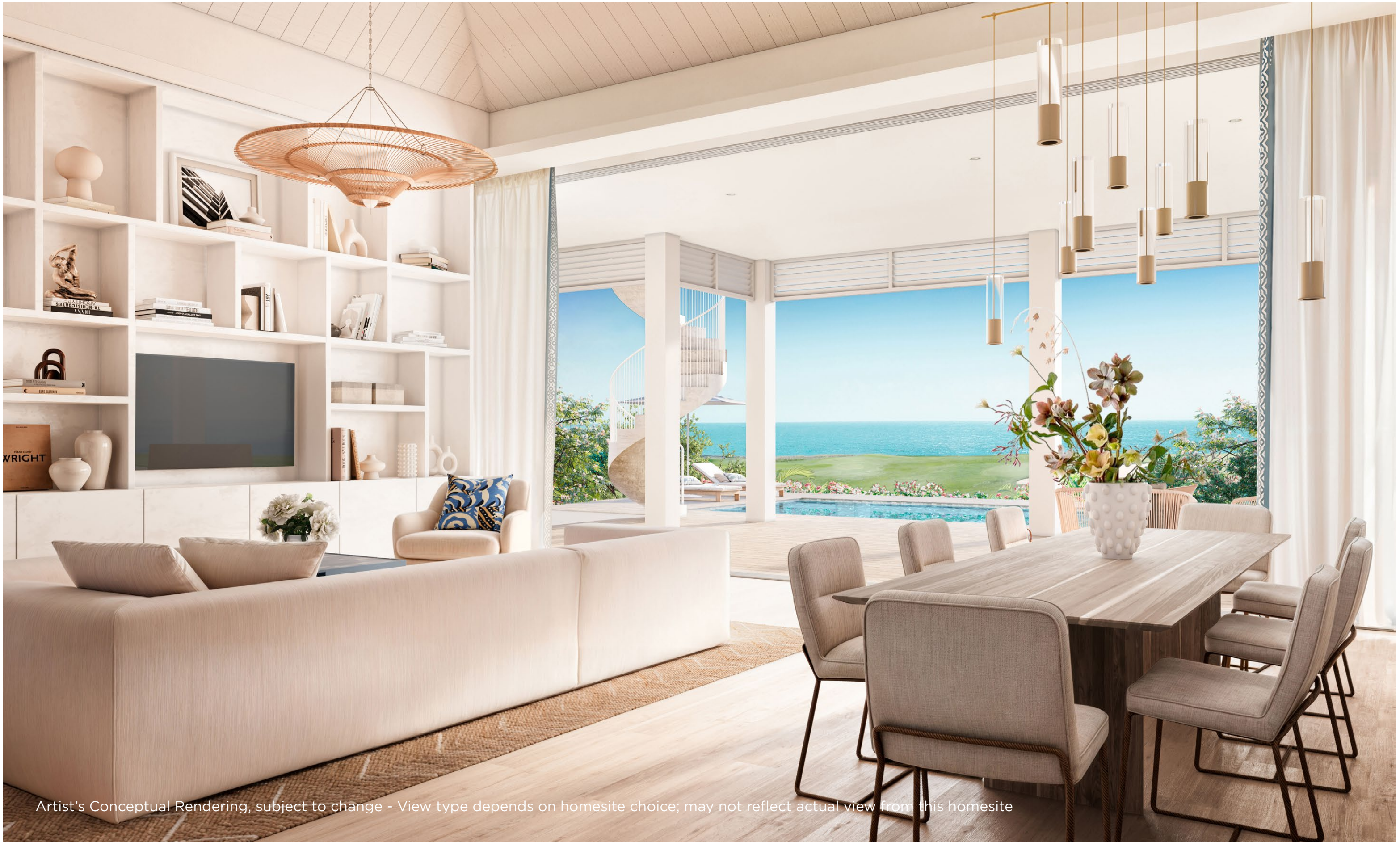
Artist's Conceptual Rendering, subject to change - View type depends on homesite choice; may not reflect actual view from this homesite

The structures, materials and recreational features and amenities described and depicted herein are based upon current development plans, which are subject to change without notice. The illustrations included herein are artist renderings of proposed improvements. We are pledged to the letter and spirit of U.S. policy for the achievement of equal housing throughout the nation. We encourage and support an affirmative advertising, marketing and sales program in which there are no barriers to obtaining housing because of race, color, sex, religion, handicap, familial status or national origin. WARNING: THE CALIFORNIA BUREAU OF REAL ESTATE HAS NOT EXAMINED THIS OFFERING, INCLUDING, BUT NOT LIMITED TO, THE CONDITION OF TITLE, THE STATUS OF BLANKET LIENS ON THE PROJECT (IF ANY), ARRANGEMENTS TO ASSURE PROJECT COMPLETION, ESCROW PRACTICES, CONTROL OVER PROJECT MANAGEMENT, RACIALLY DISCRIMINATORY PRACTICES (IF ANY), TERMS, CONDITIONS, AND PRICE OF THE OFFER, CONTROL OVER ANNUAL ASSESSMENTS (IF ANY), OR THE AVAILABILITY OF WATER, SERVICES, UTILITIES, OR IMPROVEMENTS. IT MAY BE ADVISABLE FOR YOU TO CONSULT AN ATTORNEY OR OTHER KNOWLEDGEABLE PROFESSIONAL WHO IS FAMILIAR WITH REAL ESTATE AND A LAW IN THE COUNTRY WHERE THIS SUBDIVISION IS SITUATED. Any offers contained herein are not directed to residents in any state in which a registration is required but in which registration requirements have not yet been met, including, but not limited to, New Jersey.