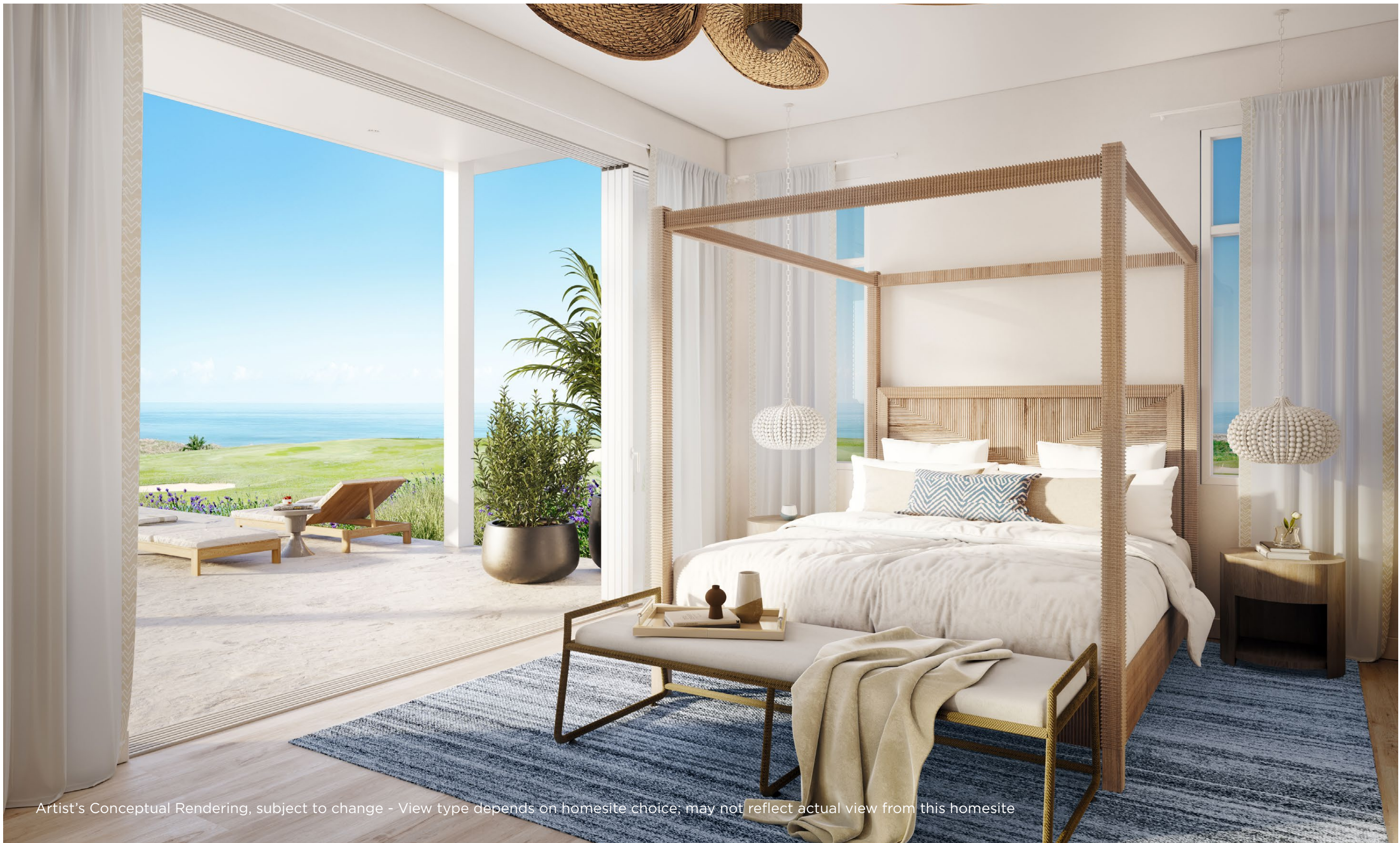
Artist's Conceptual Rendering, subject to change - View type depends on homesite choice; may not reflect actual view from this homesite

The structures, materials and recreational features and amenities described and depicted herein are based upon current development plans, which are subject to change without notice. The illustrations included herein are artist renderings of proposed improvements. We are pledged to the letter and spirit of U.S. policy for the achievement of equal housing throughout the nation. We encourage and support an affirmative advertising, marketing and sales program in which there are no barriers to obtaining housing because of race, color, sex, religion, handicap, familial status or national origin. WARNING: THE CALIFORNIA BUREAU OF REAL ESTATE HAS NOT EXAMINED THIS OFFERING, INCLUDING, BUT NOT LIMITED TO, THE CONDITION OF TITLE, THE STATUS OF BLANKET LIENS ON THE PROJECT (IF ANY), ARRANGEMENTS TO ASSURE PROJECT COMPLETION, ESCROW PRACTICES, CONTROL OVER PROJECT MANAGEMENT, RACIALLY DISCRIMINATORY PRACTICES (IF ANY), TERMS, CONDITIONS, AND PRICE OF THE OFFER, CONTROL OVER ANNUAL ASSESSMENTS (IF ANY), OR THE AVAILABILITY OF WATER, SERVICES, UTILITIES, OR IMPROVEMENTS. IT MAY BE ADVISABLE FOR YOU TO CONSULT AN ATTORNEY OR OTHER KNOWLEDGEABLE PROFESSIONAL WHO IS FAMILIAR WITH REAL ESTATE AND A LAW IN THE COUNTRY WHERE THIS SUBDIVISION IS SITUATED. Any offers contained herein are not directed to residents in any state in which a registration is required but in which registration requirements have not yet been met, including, but not limited to, New Jersey.