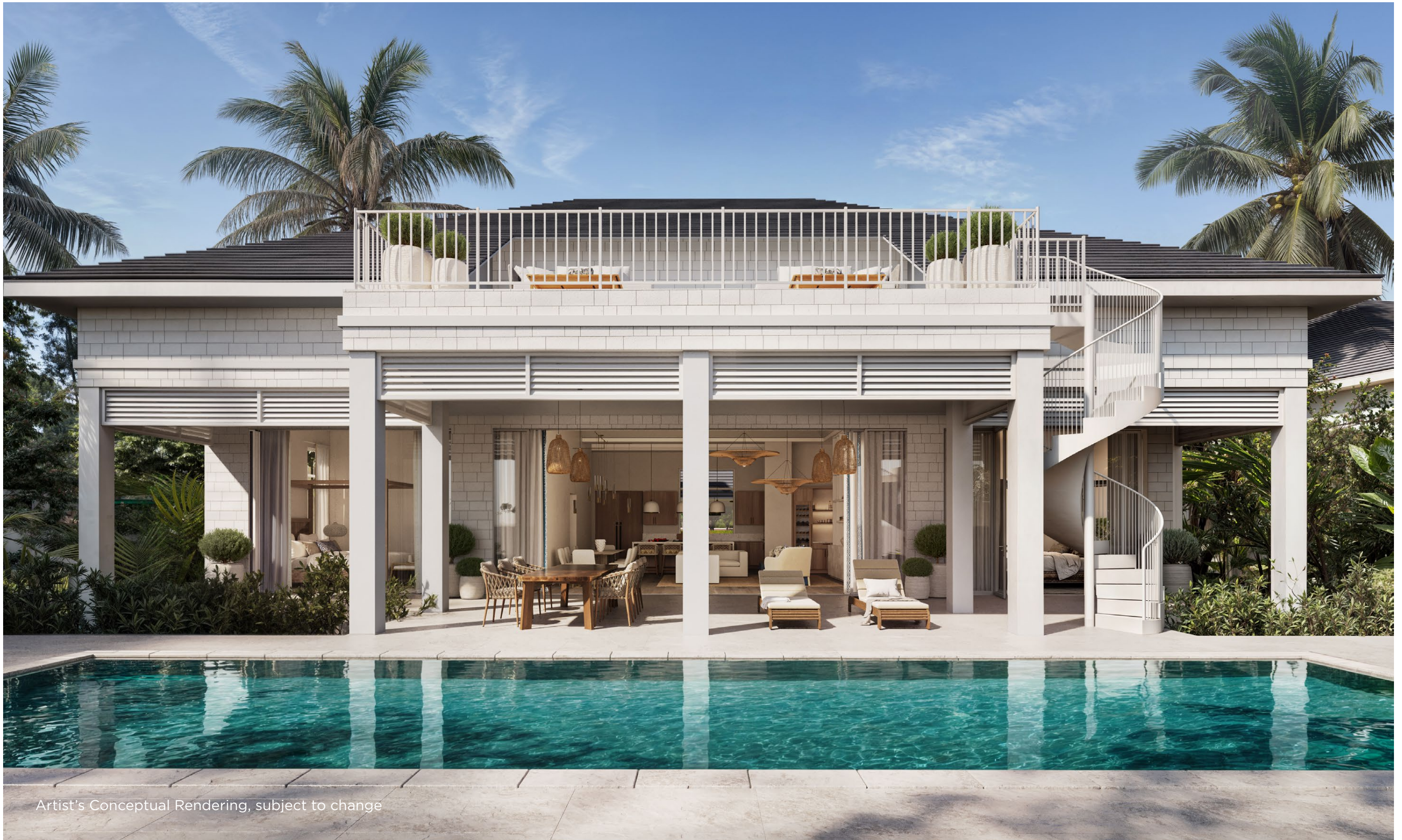
Artist's Conceptual Rendering, subject to change

The structures, materials and recreational features and amenities described and depicted herein are based upon current development plans, which are subject to change without notice. The illustrations included herein are artist renderings of proposed improvements. We are pledged to the letter and spirit of U.S. policy for the achievement of equal housing throughout the nation. We encourage and support an affirmative advertising, marketing and sales program in which there are no barriers to obtaining housing because of race, color, sex, religion, handicap, familial status or national origin. WARNING: THE CALIFORNIA BUREAU OF REAL ESTATE HAS NOT EXAMINED THIS OFFERING, INCLUDING, BUT NOT LIMITED TO, THE CONDITION OF TITLE, THE STATUS OF BLANKET LIENS ON THE PROJECT (IF ANY), ARRANGEMENTS TO ASSURE PROJECT COMPLETION, ESCROW PRACTICES, CONTROL OVER PROJECT MANAGEMENT, RACIALLY DISCRIMINATORY PRACTICES (IF ANY), TERMS, CONDITIONS, AND PRICE OF THE OFFER, CONTROL OVER ANNUAL ASSESSMENTS (IF ANY), OR THE AVAILABILITY OF WATER, SERVICES, UTILITIES, OR IMPROVEMENTS. IT MAY BE ADVISABLE FOR YOU TO CONSULT AN ATTORNEY OR OTHER KNOWLEDGEABLE PROFESSIONAL WHO IS FAMILIAR WITH REAL ESTATE AND A LAW IN THE COUNTRY WHERE THIS SUBDIVISION IS SITUATED. Any offers contained herein are not directed to residents in any state in which a registration is required but in which registration requirements have not yet been met, including, but not limited to, New Jersey.