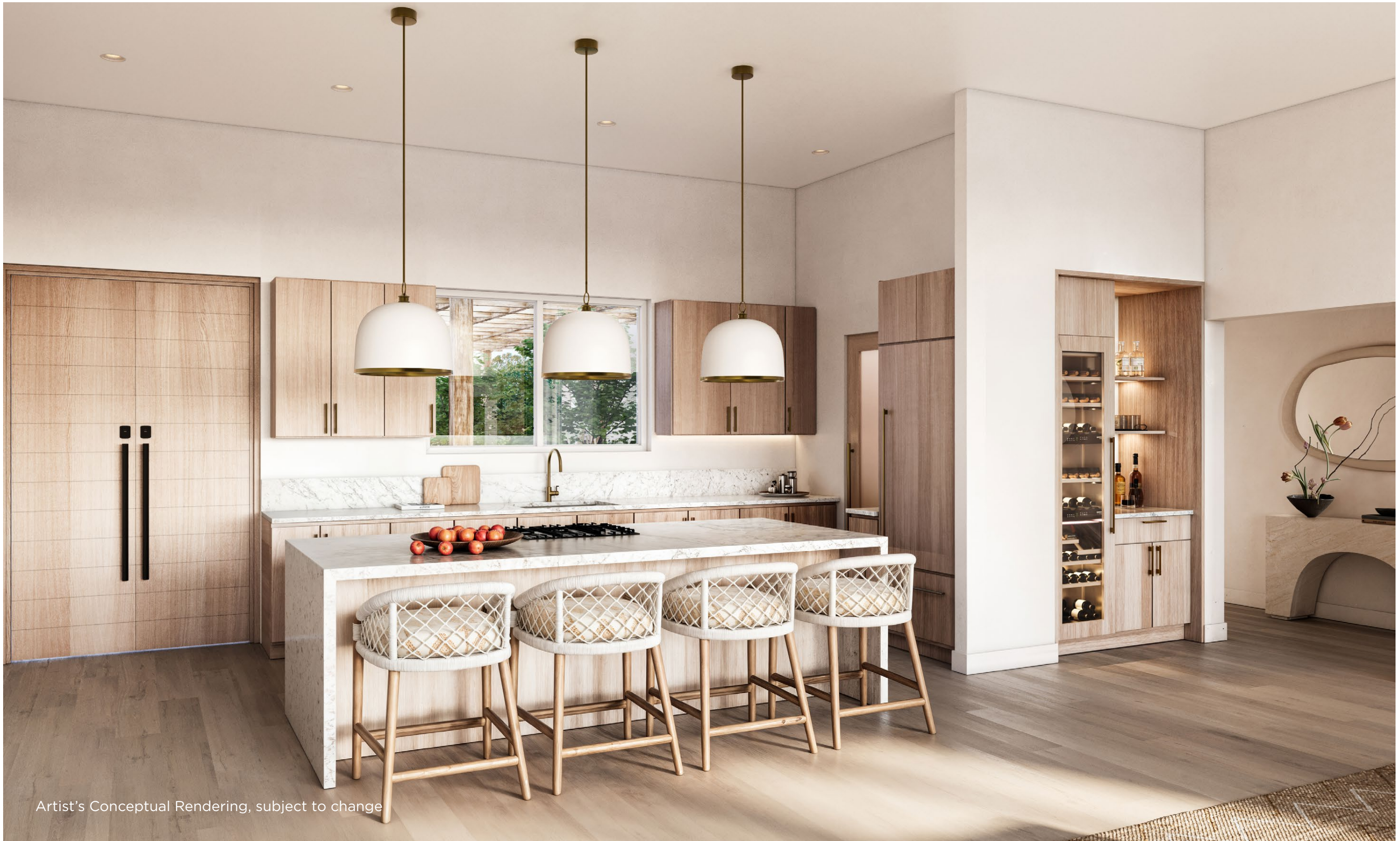
Artist's Conceptual Rendering, subject to change

The structures, materials and recreational features and amenities described and depicted herein are based upon current development plans, which are subject to change without notice. The illustrations included herein are artist renderings of proposed improvements. We are pledged to the letter and spirit of U.S. policy for the achievement of equal housing throughout the nation. We encourage and support an affirmative advertising, marketing and sales program in which there are no barriers to obtaining housing because of race, color, sex, religion, handicap, familial status or national origin. WARNING: THE CALIFORNIA BUREAU OF REAL ESTATE HAS NOT EXAMINED THIS OFFERING, INCLUDING, BUT NOT LIMITED TO, THE CONDITION OF TITLE, THE STATUS OF BLANKET LIENS ON THE PROJECT (IF ANY), ARRANGEMENTS TO ASSURE PROJECT COMPLETION, ESCROW PRACTICES, CONTROL OVER PROJECT MANAGEMENT, RACIALLY DISCRIMINATORY PRACTICES (IF ANY), TERMS, CONDITIONS, AND PRICE OF THE OFFER, CONTROL OVER ANNUAL ASSESSMENTS (IF ANY), OR THE AVAILABILITY OF WATER, SERVICES, UTILITIES, OR IMPROVEMENTS. IT MAY BE ADVISABLE FOR YOU TO CONSULT AN ATTORNEY OR OTHER KNOWLEDGEABLE PROFESSIONAL WHO IS FAMILIAR WITH REAL ESTATE AND A LAW IN THE COUNTRY WHERE THIS SUBDIVISION IS SITUATED. Any offers contained herein are not directed to residents in any state in which a registration is required but in which registration requirements have not yet been met, including, but not limited to, New Jersey.