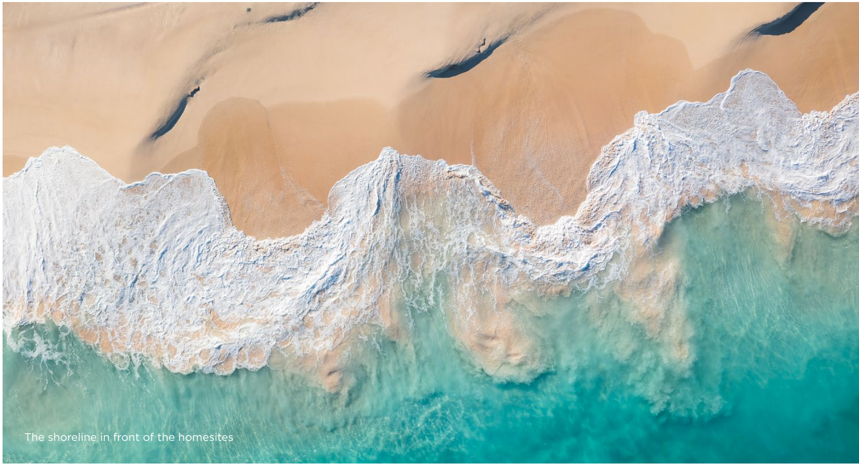
The shoreline in front of the homesites