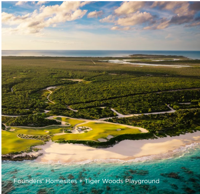
Founders' Homesites + Tiger Woods Playground