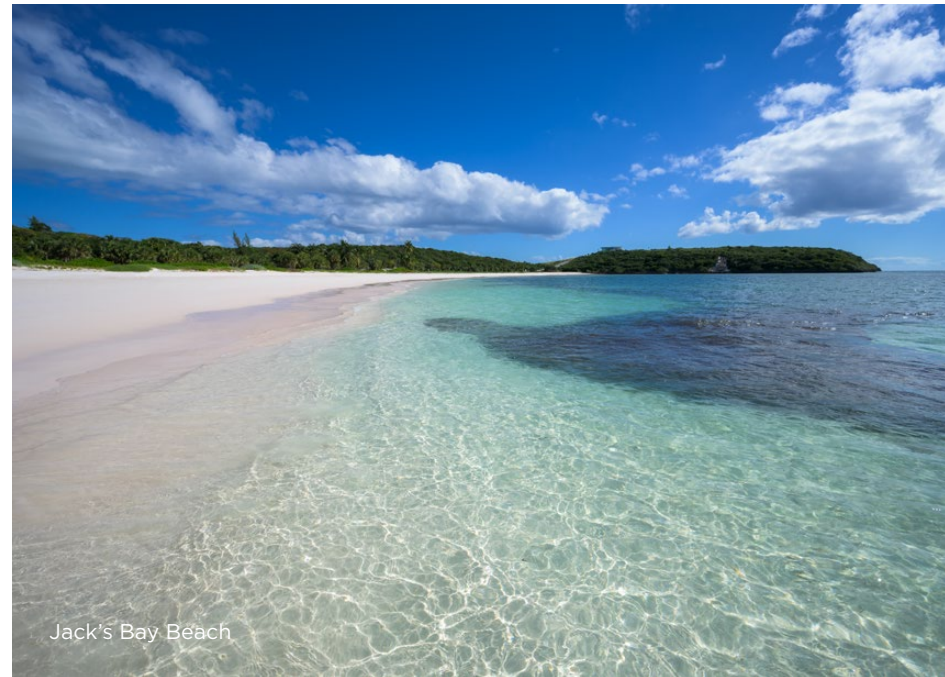
Jack's Bay Beach